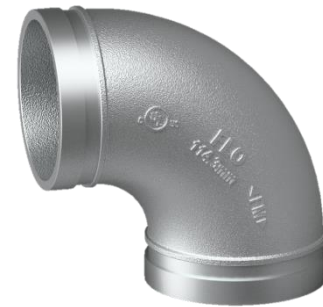
Model # E1